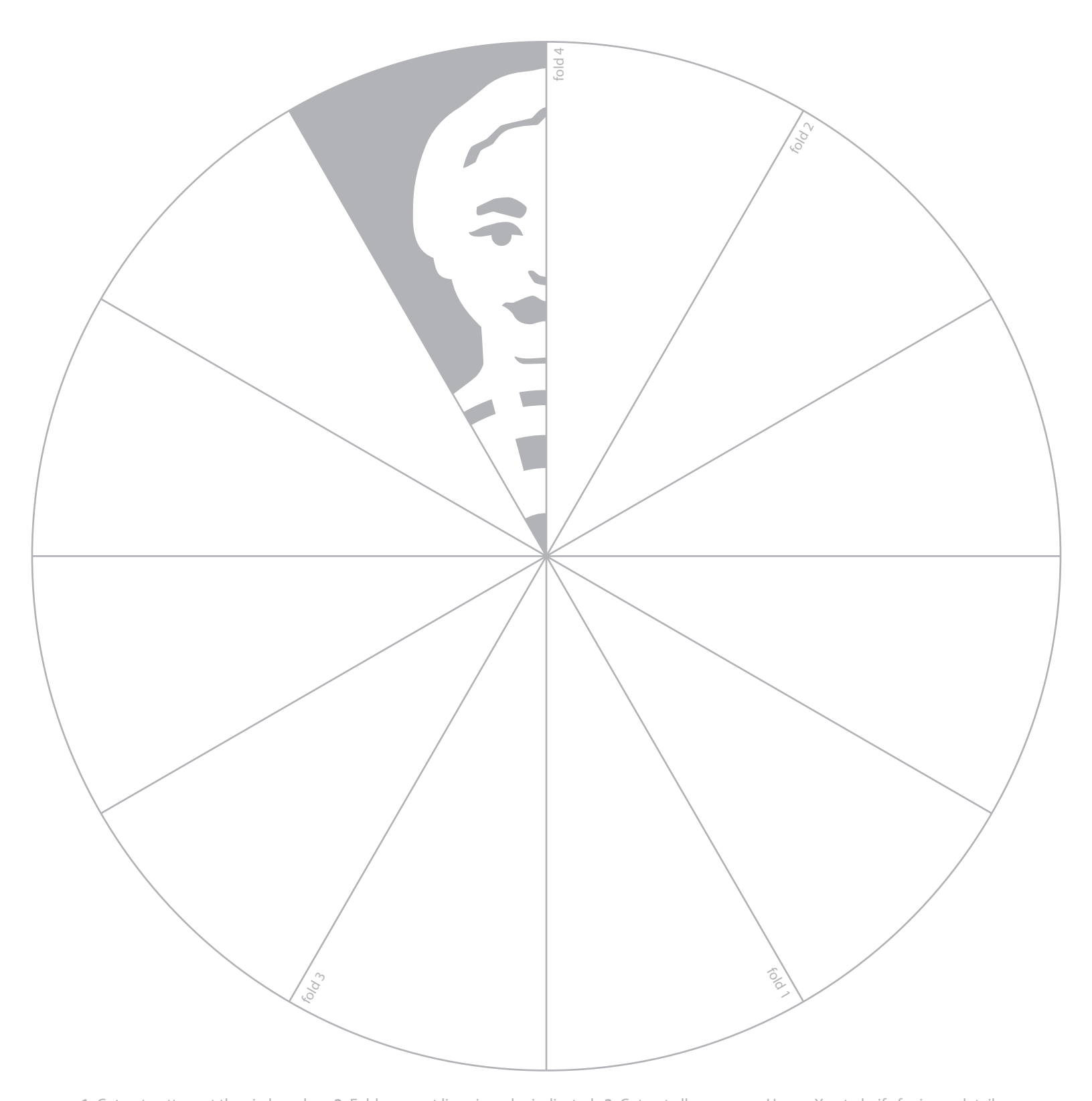
1. Cut out pattern at the circles edge. 2. Fold paper at lines in order indicated. 3. Cut out all grey areas. Use an X-acto knife for inner details.